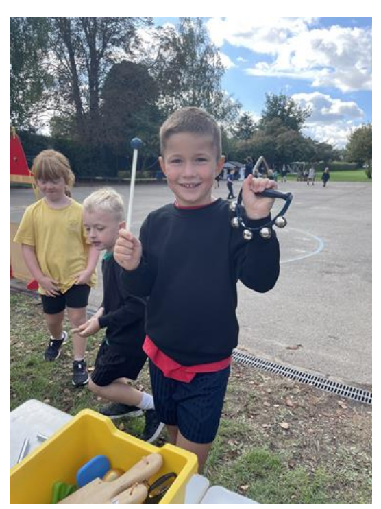
Palace Wood Primary School Newsletter

This week Year 1 have been learning about pulse and rhythm. We have been clapping the rhythm to our names and different tunes. We then applied this learning in our choosing time and used the instruments to continue exploring this.